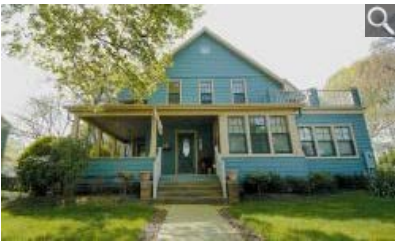
The Freehold Borough Historic Advisory Commission recently honored two homeowners for their efforts to maintain, restore and beautify their homes. Top photo shows a home on South Street, which received the Restoration Award. Bottom photo shows a home on Brinckerhoff Avenue, which received the Preservation Award.

The borough of Freehold is known for its character, its small-town ambiance and its historic homes.